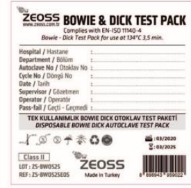
Bowie Dick Test Packs